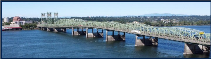
109-year-old I-5 Bridge

Freight and Commerce Challenge Washington and Oregon are among the top freight-dependent states in the US. Yet we are hampered by two of the nation’s worst freight and commerce chokepoints just six miles apart (ATRI, 2025) requiring bi-state coordination: I-5 Bridge across the Columbia River (#31) and I-5 at I-84 Rose Quarter (#27). These are the two worst chokepoints in the Pacific Northwest.