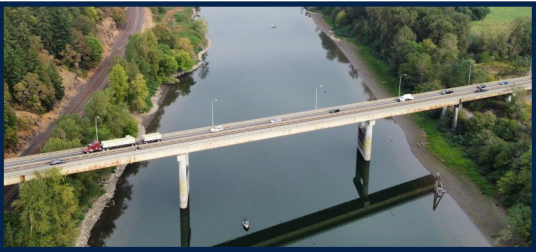
60-year-old West Camas Slough Bridge

Challenge: To support community development, population and economic growth, and urban vibrancy, our communities have a growing list of transportation and infrastructure priorities totaling $740M.