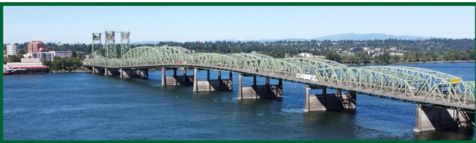
108-year-old I-5 Bridge