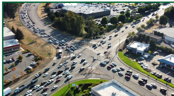
Chronically-congested SR-500/Fourth Plain/SR-503 intersection

We urge legislators to embrace the following priorities where possible: • Support Lower Columbia River deepwater shipping channel for the next 20-years, through the USACE's channel maintenance plan. • Fund regionally significant freight mobility improvements for river, road and rail for Ports, as well as track improvements for the county-owned Chelatchie Prairie Railroad. • Stabilize statewide programs including the Public Works Trust Fund, CERB, FMSIB, TIB and FRAP, and protect Tax Increment Financing (TIF). • Support broadband infrastructure to disperse economic opportunity. • Actively embrace smart technologies to support conversion of public and private fleets to alternative fuels where practical. • Support the evaluation of transportation investments to help ensure equity and climate goals. • Place high priority on long-range land-use and strategic transportation corridor planning to serve steadily rising population and commerce forecasts, including a third corridor across the Columbia River.