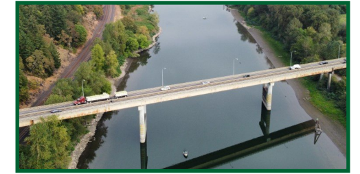
60-year-old West Camas Slough Bridge.

Challenge: To support community development, population and economic growth, and urban vibrancy, our communities have a growing list of transportation and infrastructure priorities totaling $700M.