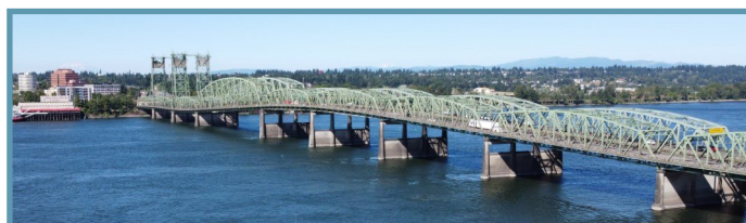
107-year old I-5 Bridge

The I-5 bridge spans are functionally obsolete, seismically vulnerable and require outsized maintenance investments to remain operational. A bi-state approach focused on practical solutions to improve mobility throughout this primary freight, commerce and commuter corridor is a regional imperative congruent with the 2002 I-5 Corridor Strategic Plan.